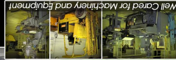
Well Cared for Machinery and Equipment